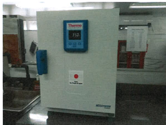
Incubator (Thermo Heratherm Model IGS60)