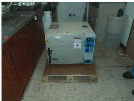
Tuttnauer, Autoclave with chamber