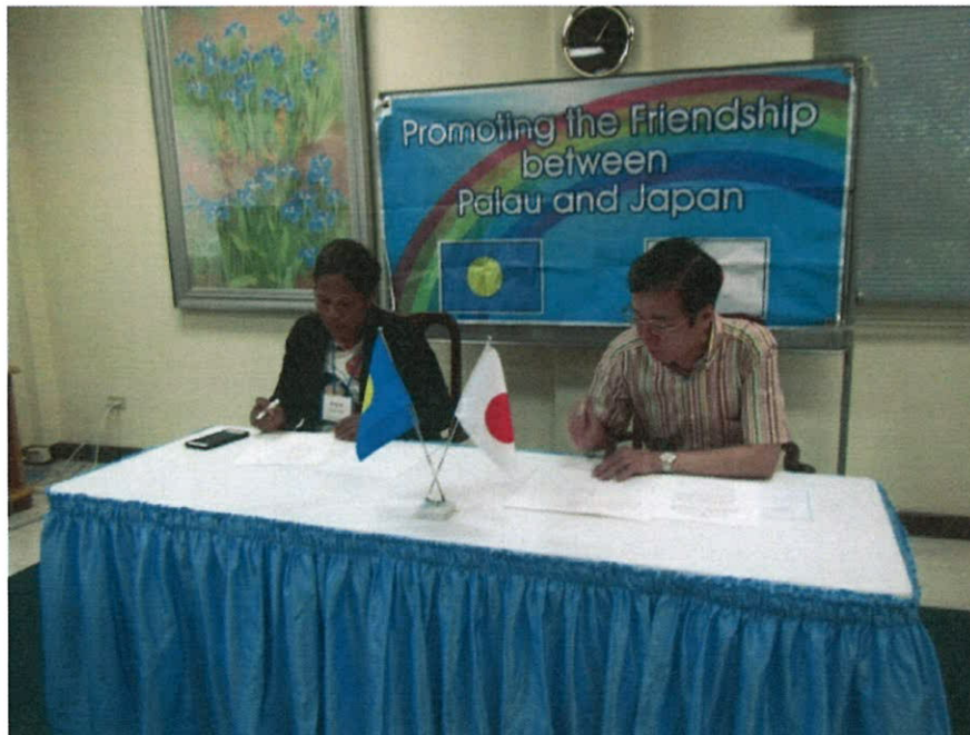
Signing Ceremony at Embassy of Japan in Palau

On March 22, 2018, the Office of the Public Auditor received your letter requesting an audit of Japan's Grant Assistance for Grass-Roots Human Security Project (GGP) awarded to the Environmental Quality Protection Board (EQPB) in amount of $62,648. The Grant awarded to the EQPB was used to procure one (1) Nissan Frontier SV 4X4 Pick-Up, (1) Manual Autoclave and (1) Thermo Heratherm for a total cost of $67,493.00, the difference paid for by the EQPB via the Republic of Palau national treasury as further explained in this report. The Grant Contract between the Embassy of Japan and the Environmental Quality Protection Board was executed on November 22, 2017.