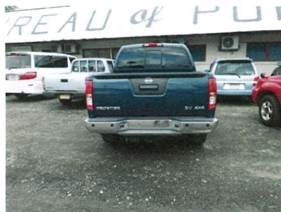
Back of Nissan Frontier SV 4X4 Pick-Up