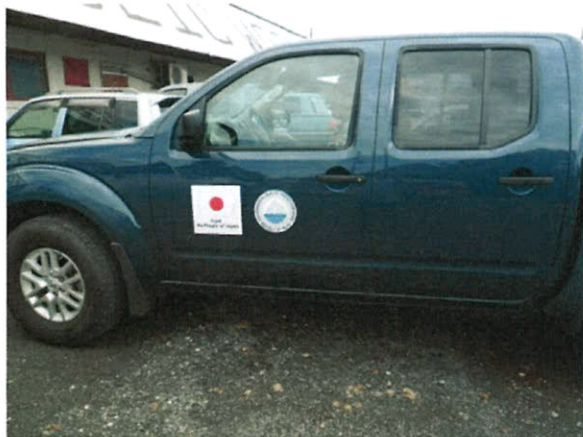
Left Side of Nissan Frontier SV 4X4 Pick-Up